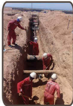
Installation C.P systems