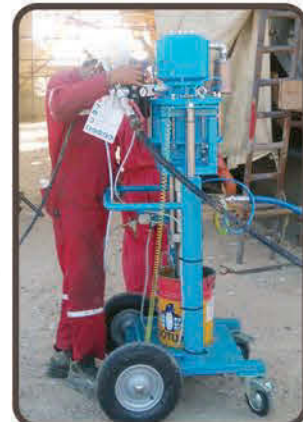
Single Airless Spray Pump