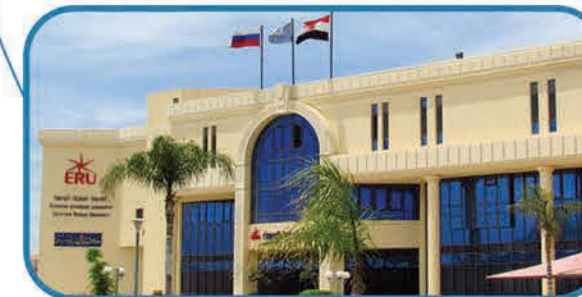
Russian University - Badr city