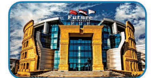
Future University - New Cairo