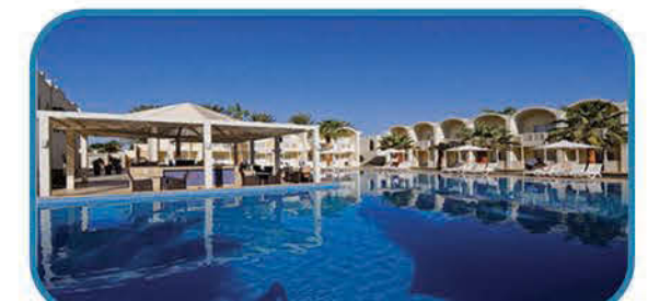
Reef Oasis Hotel - Sharm Elshiekh