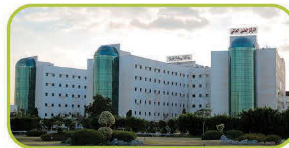
INTERNATIONAL MEDICAL CENTER