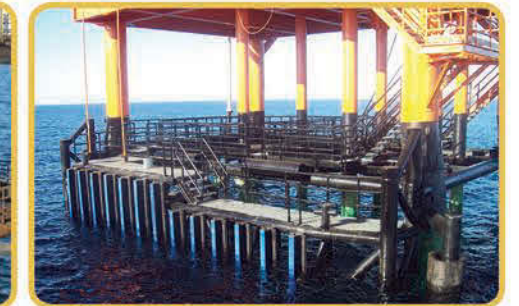
Supply, Design, Construction & Replacement of Boat landing & Barge Bumpers including the installation of Rubber Fenders.