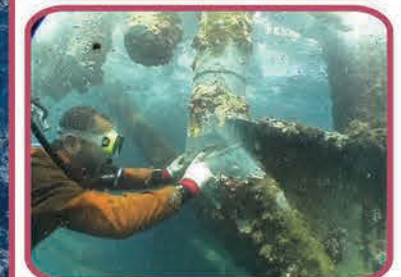
Under Water Cutting and Welding Visual Inspection.