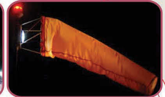
Installation Of an Integrated Explosion Proof System Of an Enhanced Lighting Fixtures System & Navigation.