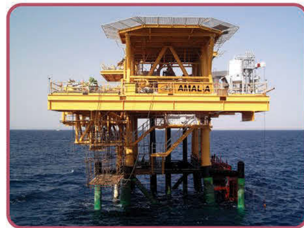
General Maintenance for Amal (A) Offshore Platform - Amapetco