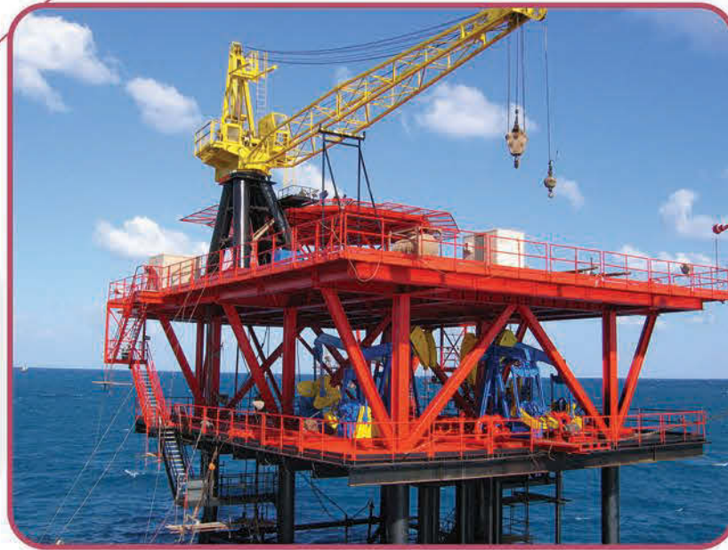
General Maintenance for Offshore Platform North Amer, FF - GPC

The Offshore Platforms Rehabilitation works include but not limited to the following: