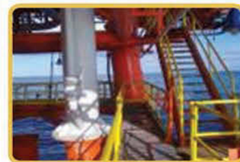
Supply, Design, Construction & Replacement of Fire Fighting System, Stairs & Grating.