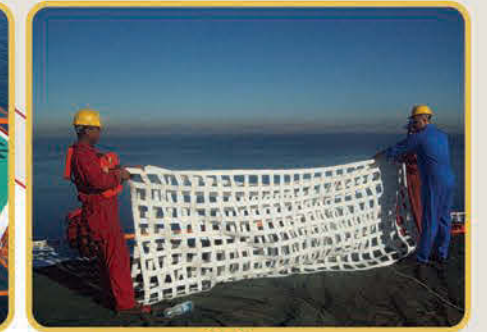
Helideck Painting, Marking and Safety Net Replacement.