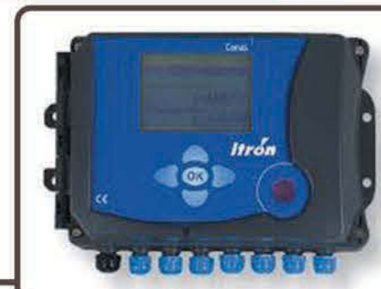
Calibration and Adjusting of Volume Corrector