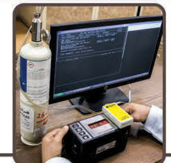
Calibration and Maintenance of Gasuveyor & Holiday detector